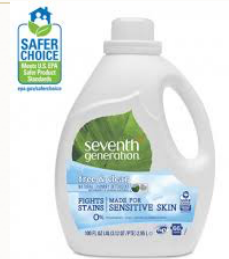
Biokleen has an excellent sports laundry & Seventh Generation, Planet, and Ecos are also very trusted brands