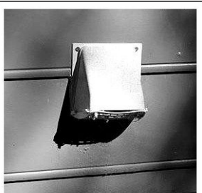
This device emits unregulated toxic chemicals to the entire neighborhood when you use conventional laundry products